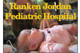
Ranken Jordan Pediatric Hospital

God has opened the door us to work each day with Cornerstone Farms , a large, Christian-based equestrian center that offers a therapeutic riding program called "Bridge the Divide." This ministry offers weekly sessions for children with disabilities as well as a one-week summer camp. During this camp week High School Youth Choir members will invest themselves in the lives of children ages 5-18 with disabilities such as spina bifida, Cerebral Palsy, Downs Syndrome, etc.