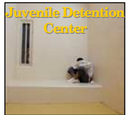
Juvenile Detention Center