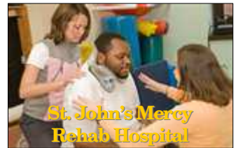
St. John's Mercy Rehab Hospital

Overland Baptist Church in St. Louis will host us that week with an invitation to sing in their evening worship service on Sunday night, and they have also opened their kitchen to us so can prepare our famous "home cooked" meals like you enjoyed in Gulf Shores.