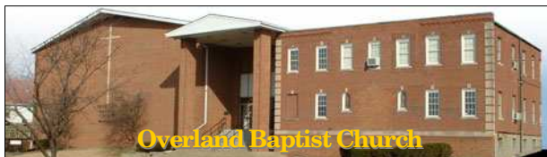
Overland Baptist Church