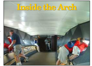
Inside the Arch

We will have the opportunity to travel to the top of the St. Louis Arch by elevator capsule. We'll visit the St. Louis Zoo and Forrest Park , the largest public park in the US and site of the 1904 World's Fair. We'll spend an evening at City Museum , a labyrinth of tunnels, caves, forests and climbing structures created with recycled material from the city's demolished buildings. We hope to attend a St. Louis Cardinals game as well as a Broadway show at the Muny , America's oldest and largest outdoor theater. We'll have lunch on the Delmar Loop and enjoy a "concrete" on Route 66 at Ted Drewes Frozen Custard ("concretes" are milkshakes so thick they serve them to you upside down without spilling a delicious drop!).